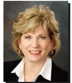
Broker • CalBRE Lic. #00658736